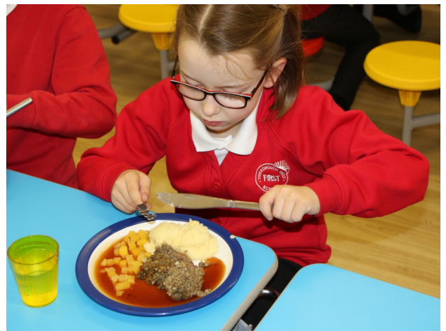
Burns Day Celebrations

All children in key stage 1 receive a free school meal. However it is important that low income families apply to the Local Authority for free school meals even if their child is eligible for a free meal already. The reason for this is that your child may be entitled to additional funding (Pupil Premium).