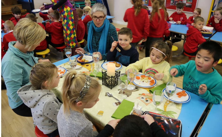
Lunch on the Captain's Table

We encourage a positive social interaction at lunch times, staff eat with the children and promote good table manners as well as encouraging children to try new foods. Children have the choice of two lunch options each day which are chosen in advance. In addition to their lunch choice they can choose from a range of salads from our salad bar. A variation of water, milk or fruit juice is also served.